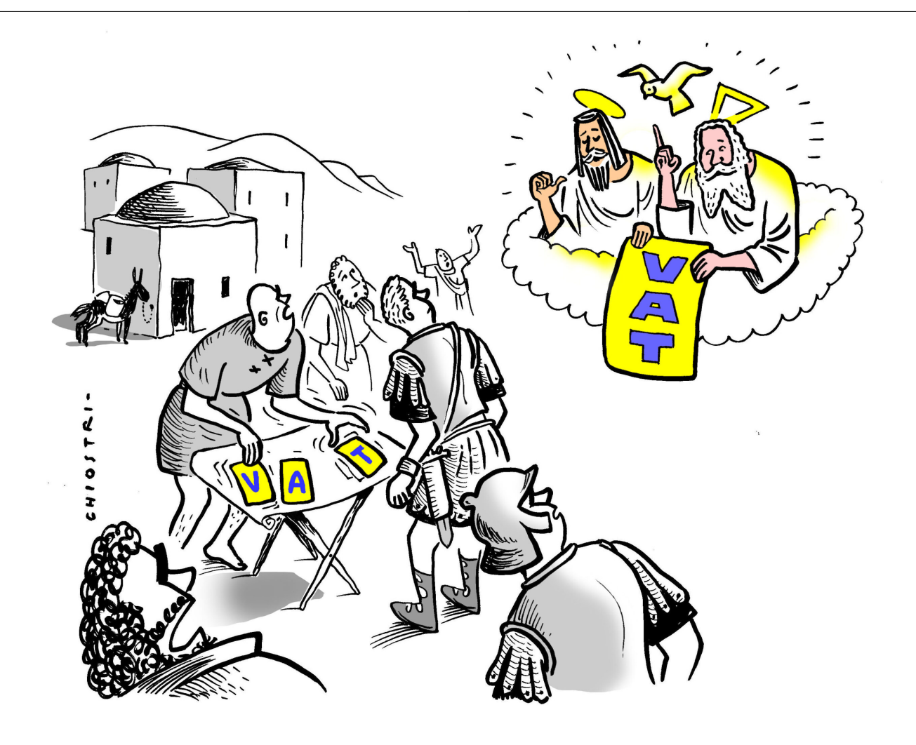
© 2021 Kluwer Law International B.V., all rights reserved.